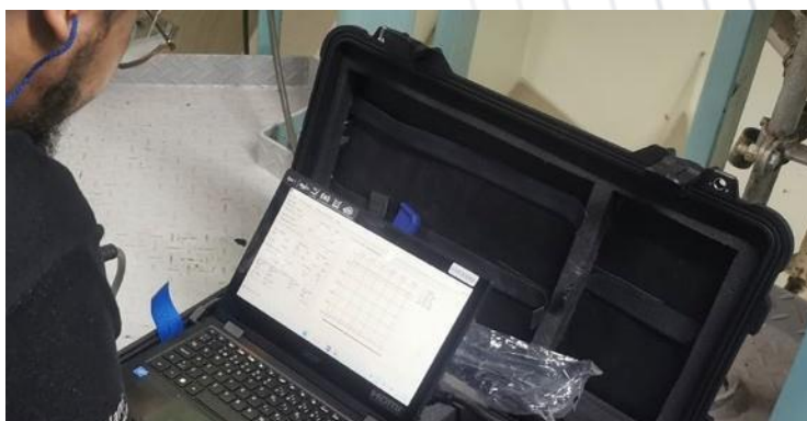
Our engineer reads the liner wear data to be used in the final report.