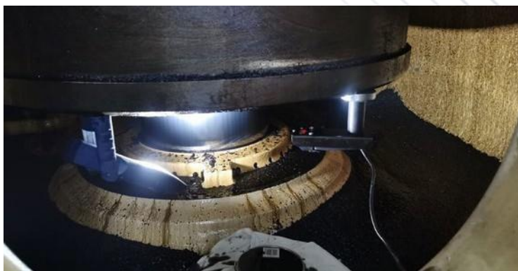
The stroke length and position of the piston is found by using laser.

+45 9857 1911 or technicalsupport@hjlubricators.com